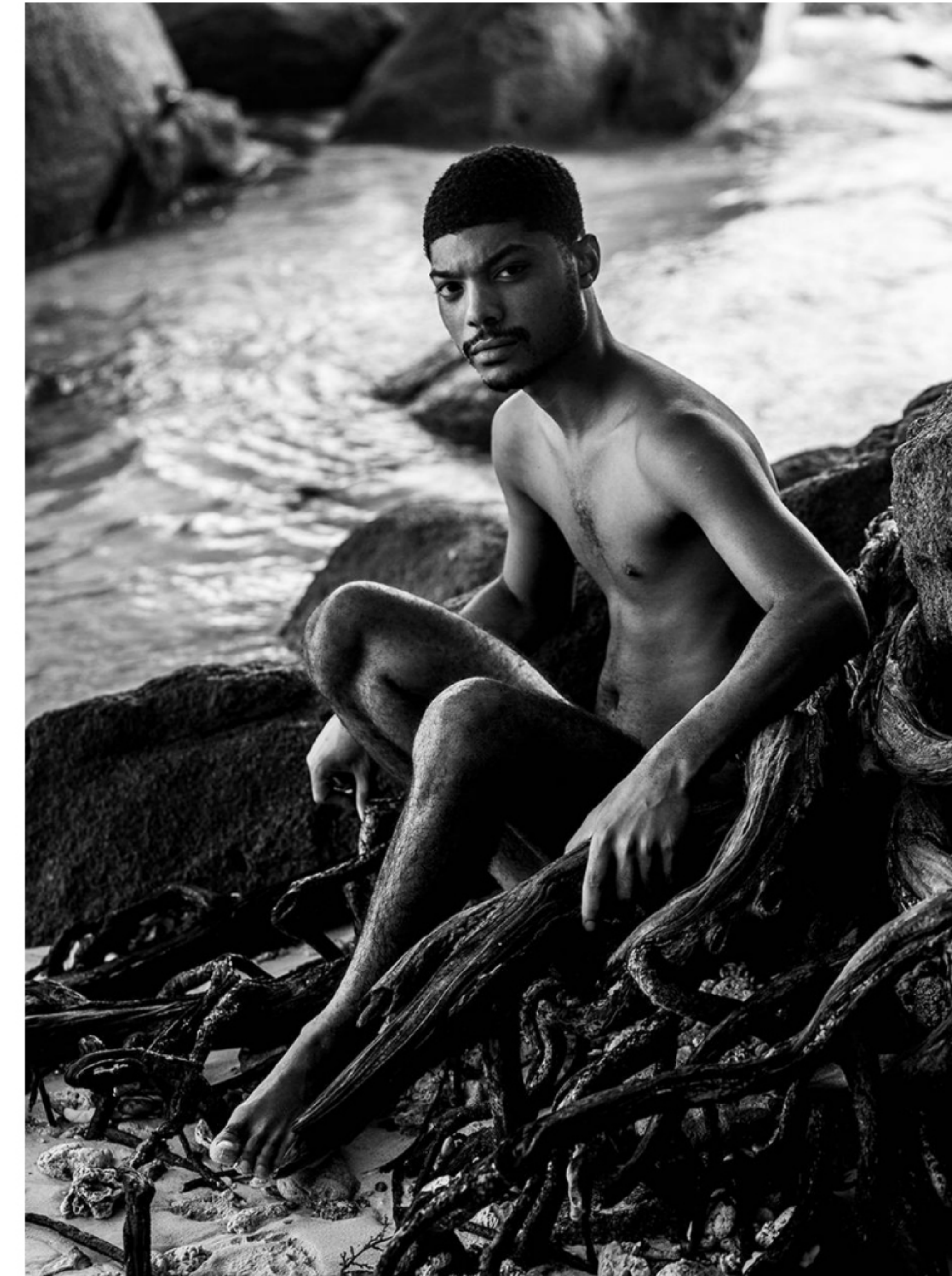
© Ruben van Schalm | Change, The young male nude seated besides the sea, 2024, Seychelles, East Africa