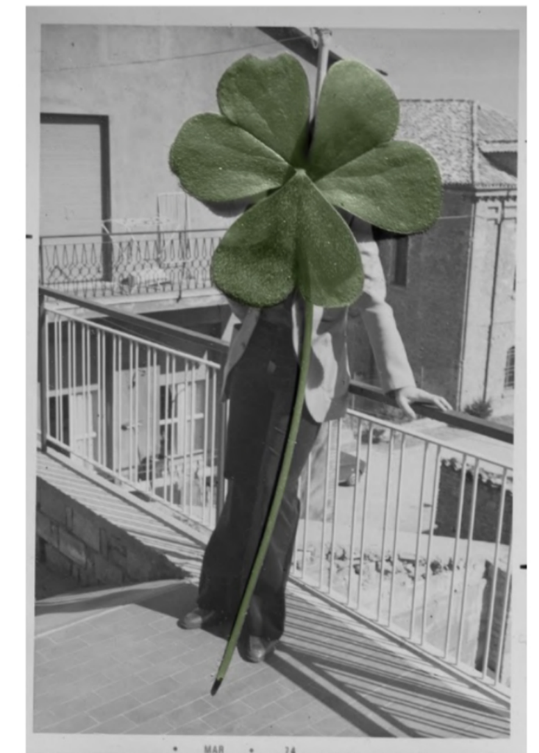
110 Ouroboros Tommaso Moni Featured