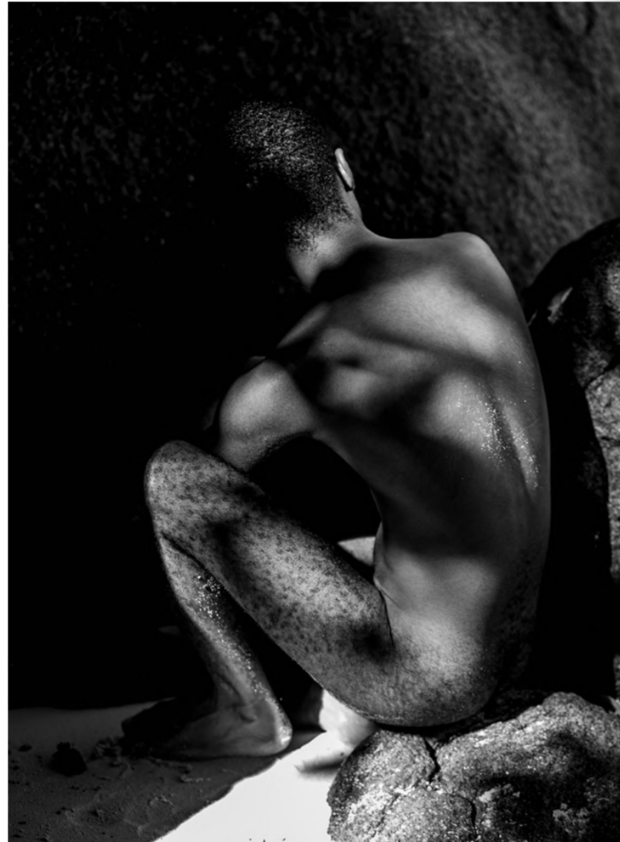
Change, The young male nude seated besides the sea, 2024, Seychelles, East Africa