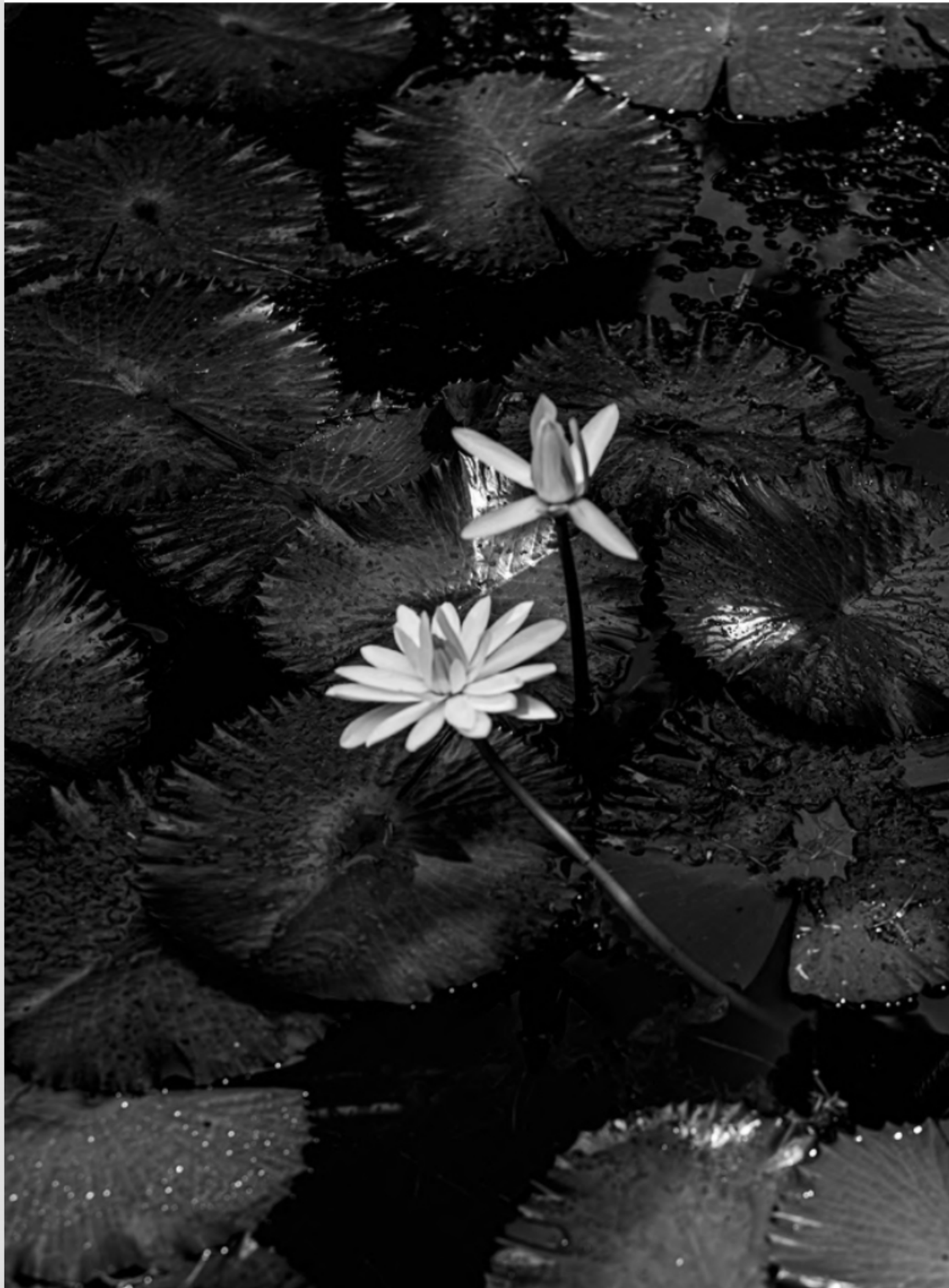
© Ruben van Schalm | Change, Water lilies blossom, 2024, Seychelles, East Africa