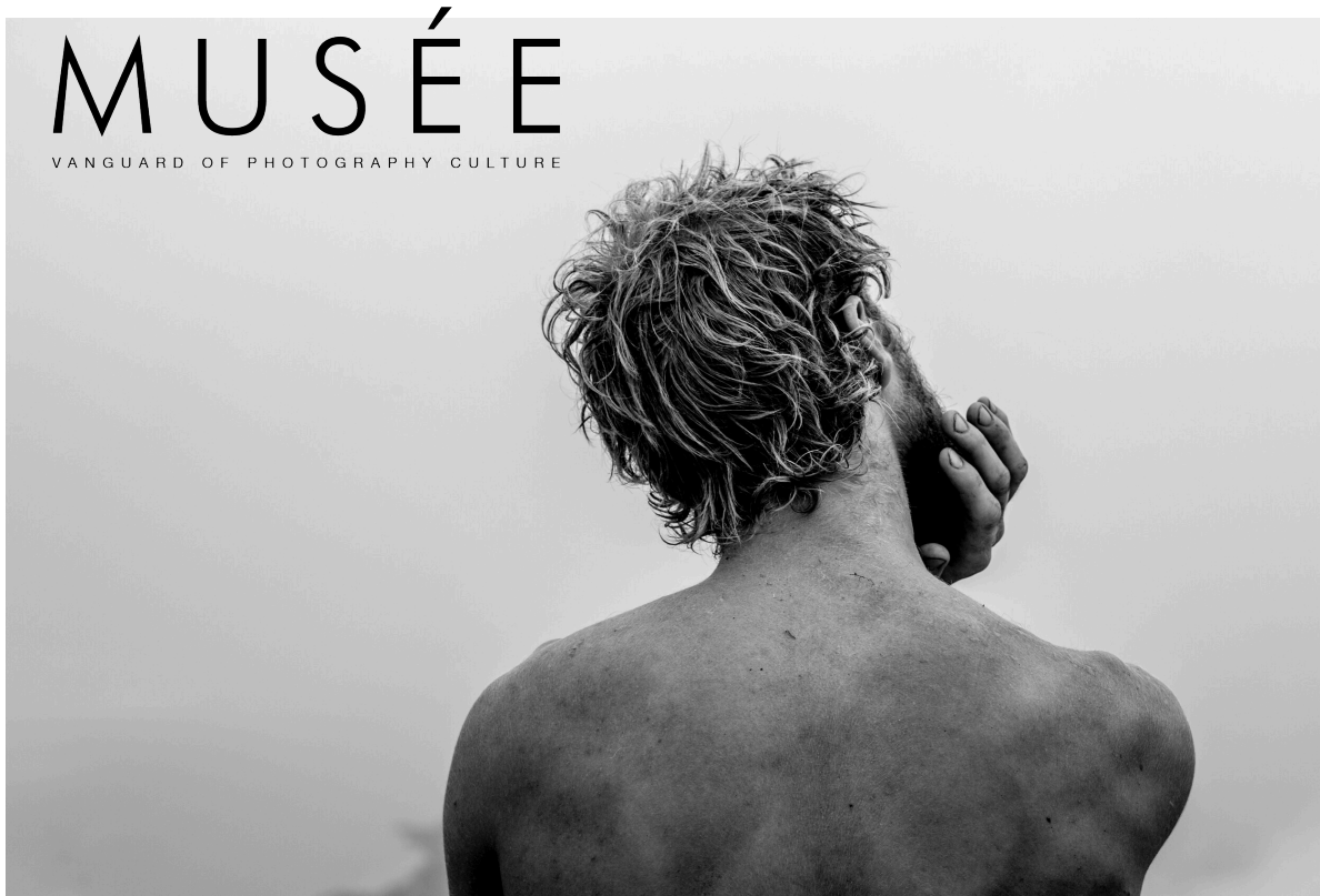
Introspection ©Ruben Van Schalm