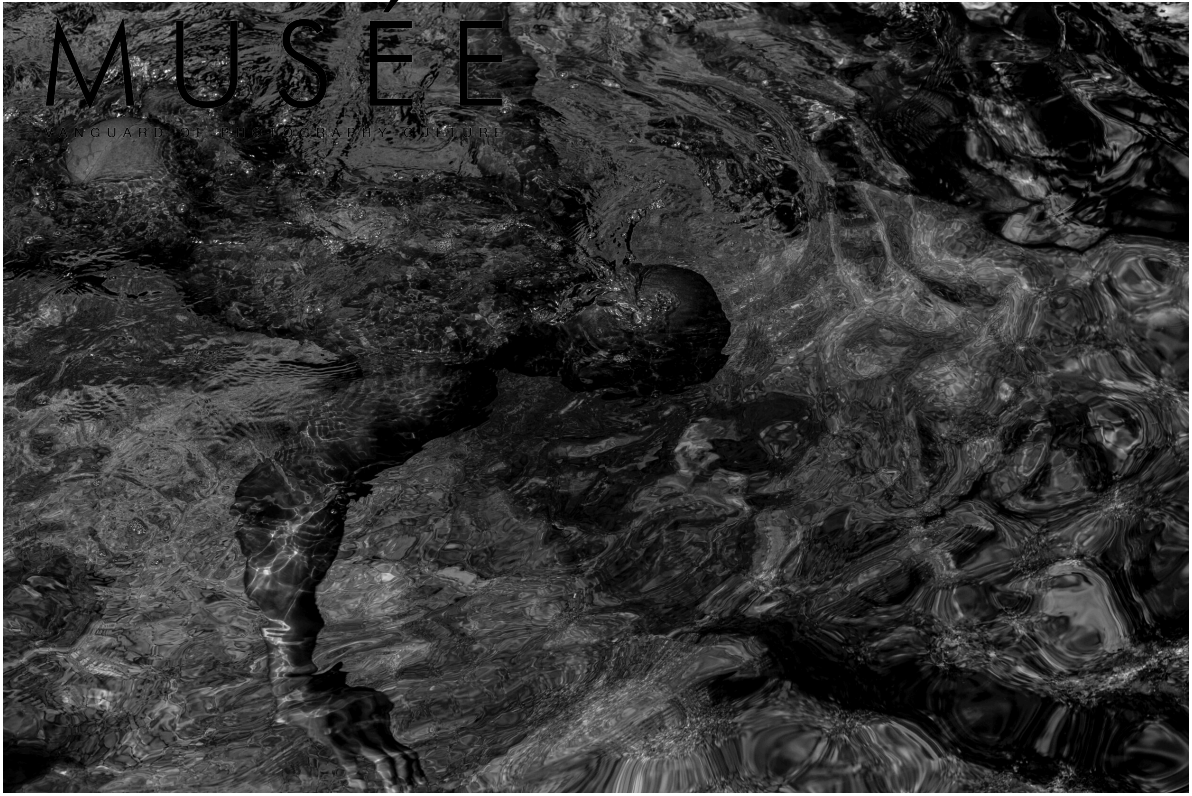
Hold Your Breath