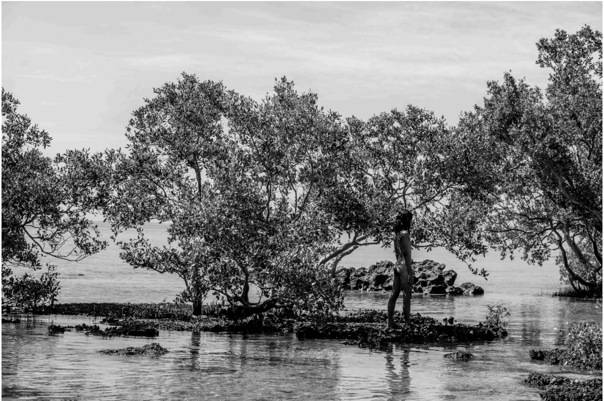
Calm Waters