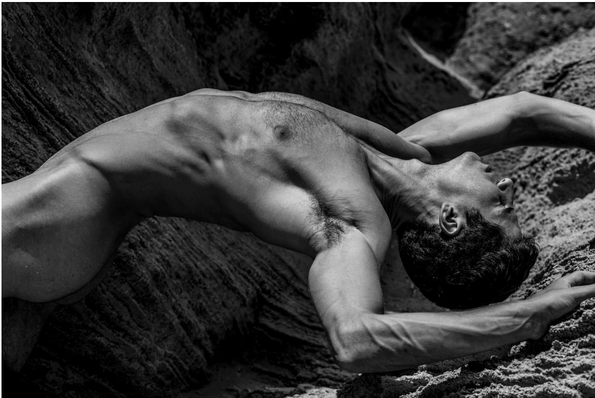
Shape Your Body

During the making of this work, he created a journey toward finding a personal paradise. The book contains unpublished photographs in black and white as well as color from several series the photographer has created over his travels between 2014–2019. By its very nature, photography has the ability to give its makers the room to carve out their own spaces in the world, no matter how imperfect life can be. The artist fused these perspectives into making this body of work. At the core of the book, is an intersection between man and landscape.