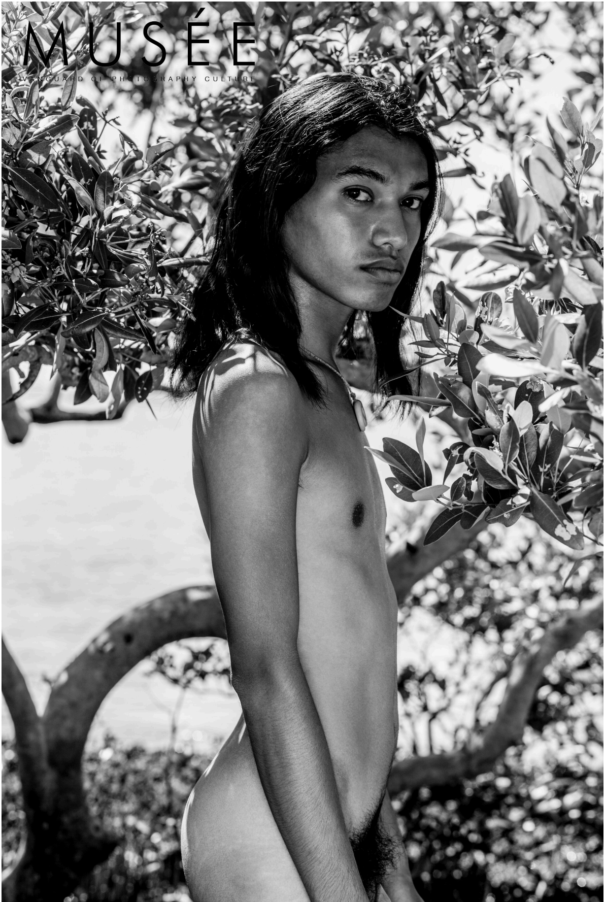
Contemplate ©Ruben Van Schalm