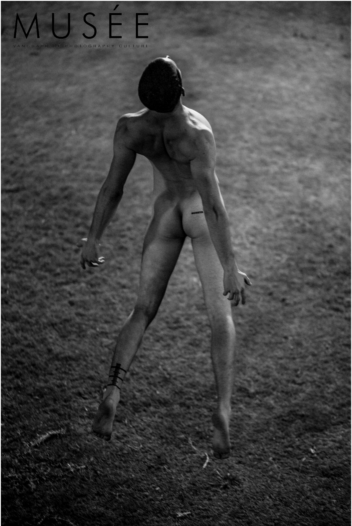
Jump ©Ruben Van Schalm

For more on this project, visit the artist's website site here ( http://www.rubenvanschalm.com/ ) and purchase a copy of the book.